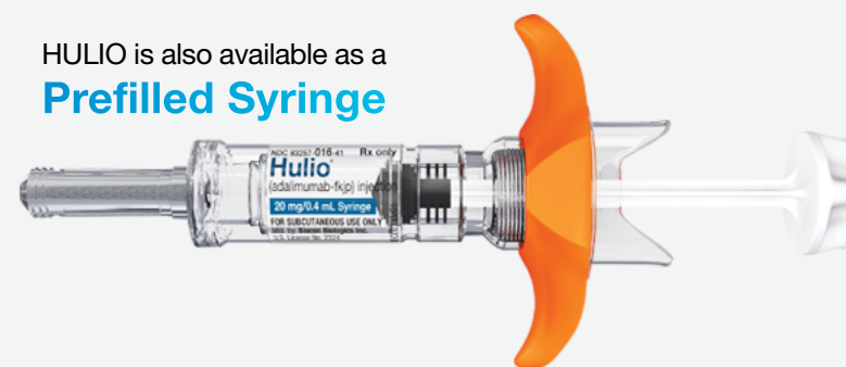
HULIO is also available as a Prefilled Syringe

There's no button to press. Just push the device against the skin to start the injection and watch the indicator display your progress.